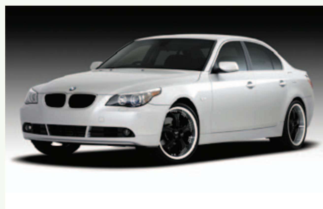
Natural fibre door panel for BMW 5 Series, compression moulded part (Germany).