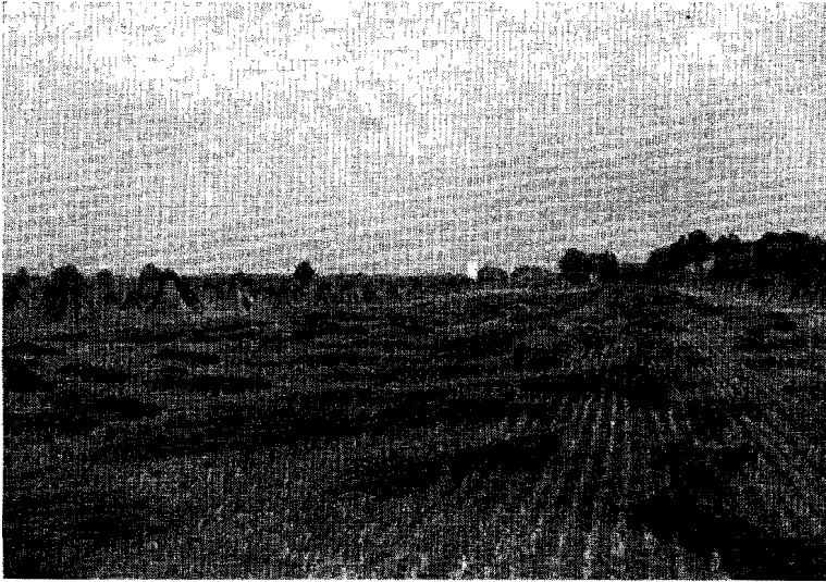
Fig. 5. The retted hemp after being bound in bundles by the gather-binder is shocked in the field until stacked or hauled to the processing plant.