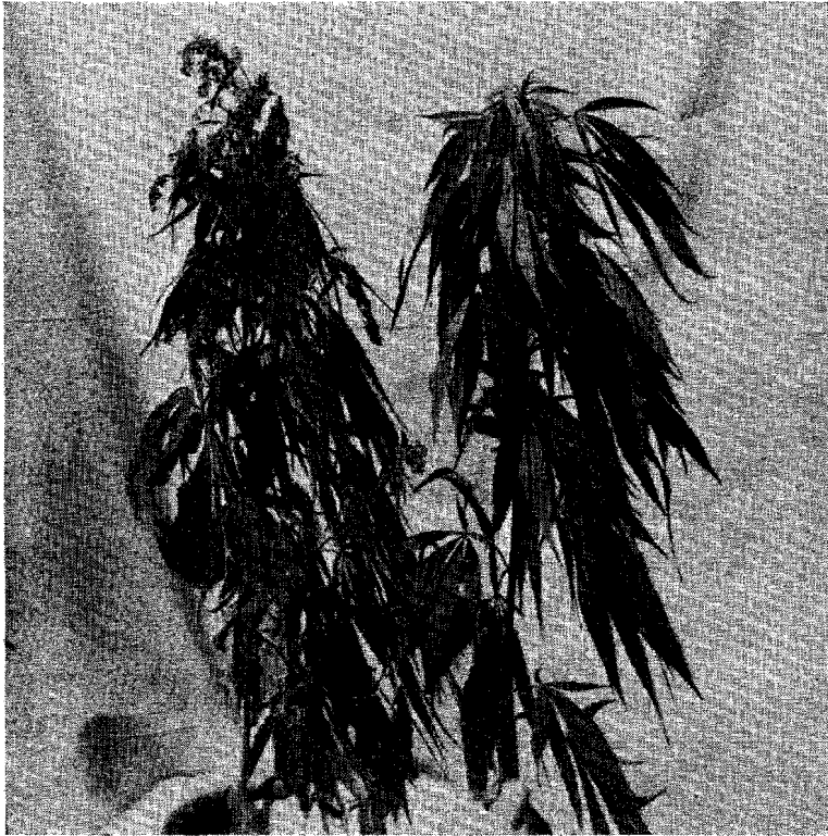
Fig. 1. Tops of hemp plants at the flowering stage. Male plant at the left and female at the right.

Steps have been taken looking to the construction of 15 mills in as many different locations in Iowa, each mill to process the hemp from about 4,000 acres. Because of the nature of the crop, hemp can be grown profitably only when a processing mill is located in the immediate vicinity of production.