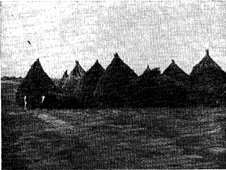
Fig. 6. After being shocked in the field, hemp is stacked on the farm or in the stack yard adjacent to the processing mill.

The waste hurds are burned for fuel to supply heat for the dryer and some or all of the power for the mill. Some