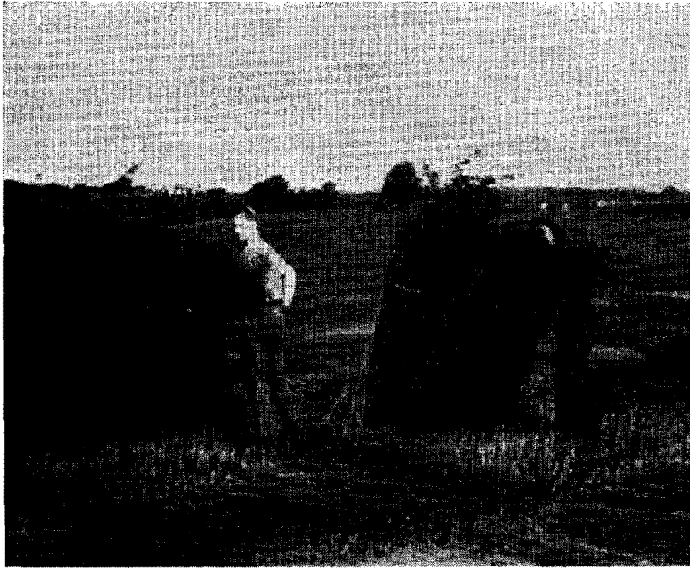
Fig. 3. After the upper surface has retted, the hemp straw is turned over to hasten the completion of the process and keep the retting uniform.

accordingly, the stalks are turned over once in the field in order to obtain uniformity in retting. In the past this has been a hand operation, but it is anticipated that simple machines may be perfected to do this now that a large acreage is involved. One man by hand can turn about 3 acres of stalks per day.