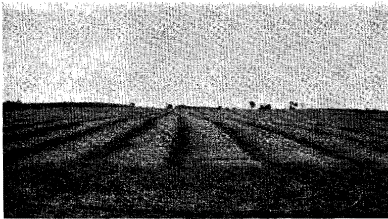
Fig. 2. Hemp lying in the swath near Brandon, Wisconsin, as spread by the harvester for retting.

On the fertile, prairie soils in Wisconsin, hemp produces about 10 to 12 tons of green stalks, or 2 to 3 tons of dry, retted stalks per acre. Preliminary experiments in 1942 at Kanawha, Iowa, and at Ames have indicated that yields equal to or greater than those reported for Wisconsin may be expected on the better soils in north central Iowa.