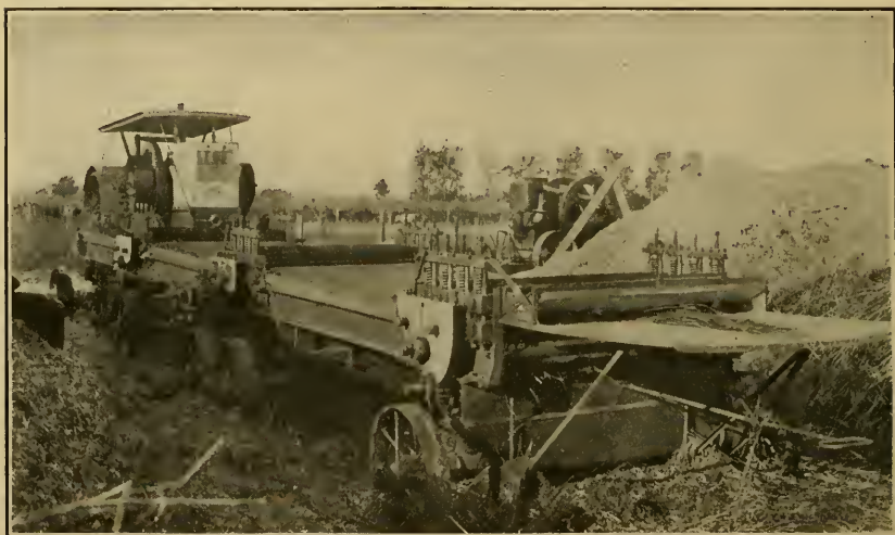
FIG. 2.—Machine brake and hemp hurds. Hemp hurds from machine brakes quickly accumulate in large piles.

Machine brakes are used in Wisconsin, Indiana, Ohio, and California, but to only a limited extent in Kentucky. Five different kinds of machine brakes are now in actual use in this country, and still others are used in Europe. All of the best hemp in Italy, commanding the highest market price paid for any hemp, is broken by machines. The better machine brakes now in use in this country prepare the fiber better and much more rapidly than the hand brakes, and they will undoubtedly be used in all localities where hemp raising is introduced as a new industry. They may also be used in Kentucky when their cost is reduced to more reasonable rates, so that they may compete with the hand brake. Hemp-breaking machines are being